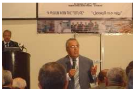
His Excellency, Professor Hatam El Gabaly, Minister of Health and Population for Egypt, MOHP Conference "Health Service Development 3" September 2007

The Egyptian Minister of Health and Population, His Excellency, Professor Hatam El Gabaly, recently used NHA findings, completed with USAID assistance, to advocate for better targeting of public health resources and expansion of social health insurance in presentations to the Egyptian Parliament. The 2002 NHA showed that 62% of all health expenditures are household out-of-pocket, up from 51% in 1995. In response to a joint request from the Ministries of Health and Population, Finance, and Planning, Health Systems 20/20 will support the implementation of another round of NHA to inform the implementation of these reforms.